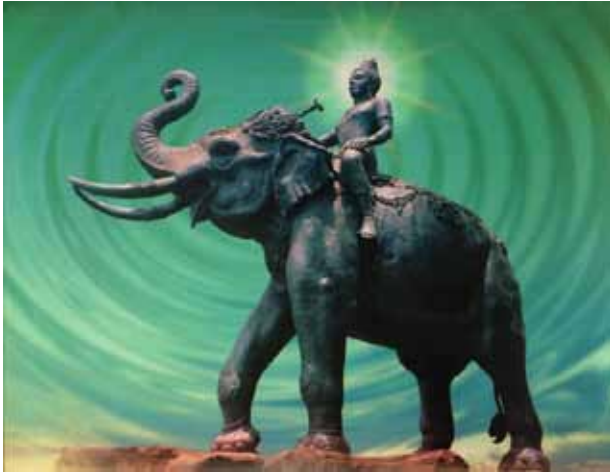
Figure 1. Phra Phutha.

Methods employed in Phra Phutha repertoire aims to narrate emotions expressed in the characteristic of Phra Phutha. The Chaloeam Triphob Doctrine states that the God Issuan created Phra Phutha from seventeen large elephants. (See Figure 1) Through the God's magical powers, the elephants were ground into refined powder and the powder was wrapped in a leaf-green cloth, sprinkled with divine water, from which Phra Phutha arose to become one of the Nine Planetary Deities of the auspicious type, who would yield a sense of gentleness and sweetness (Wisandaronkorn, 1997). For this reason, those born on Wednesday, or Wan Phutha in Thai, are reputed to be gentle in behavior, polite in manner, sweet in words and witty in talk or discussion in the same way as the "God of Rhetoric". The main characteristic of Phra Phutha is "communication and talk" in the same way as Hermes or Mercury, the God of Medicine and Communication, a son of Zeus and Maya, in Greek mythology. Therefore, the style and melody of Phra Phutha repertoire will show his communicative strategy through sweet and gentle words.