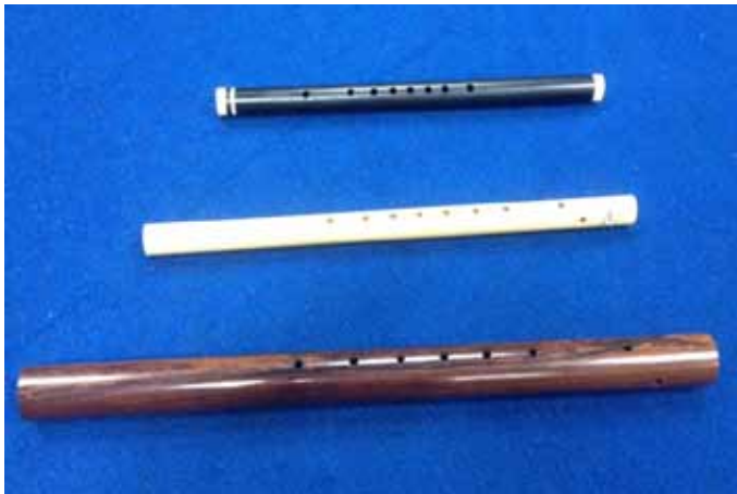
Figure 2. Photos of the Khloi Lip (top), the Khloi Phieng-or (middle) and the Khloi Ou (bottom).

in speed (Fast tempos), feelings of happiness, excitement, wonder, anger or fear will be stirred. If the music's tempo is reduced in speed (Slow tempos), feelings of sadness, silence and gentleness are felt. The sound level (Pitch) is related to the frequency of the musical sound, which can be measured in rounds per second. These are both high pitched (sharp) and low pitched (deep-toned). The use of a high pitch can create a sense of grandeur, imagination, excitement, anger or fear. The use of a low pitch can create a sense of sadness, boredom, dignity or violence. Sound control (Articulation) is a way of making musical performance communicate emotions to the audience, for example, staccato notes are very short and crisp can create an atmosphere of fun, joy, fear or anger and Legato notes are long and connected can create an atmosphere of sadness, gentleness, softness or violence (Farrar, 2003).