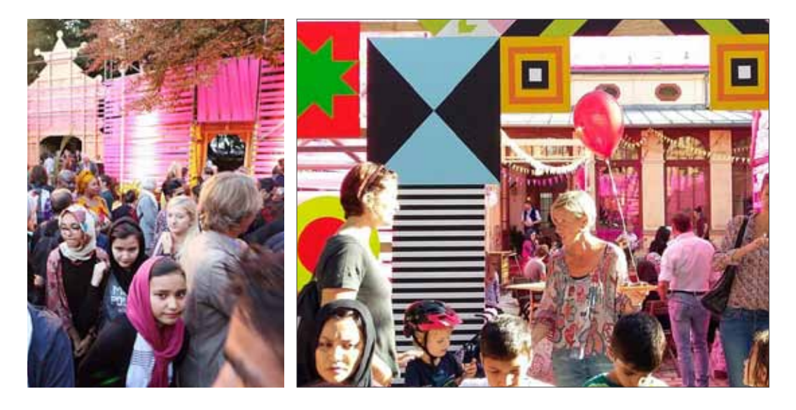
Figure 1. House of open gates – Welcoming and recreation center for refugees in the Peoples Park.

Following up on the practice of inviting to a public discussion around both the social and cultural relevance of the works being presented at the festival, this years Tonal War symposium ventured into the cultural battlefield to ask how to-days composers and musicians can deal with the horrors of the 21st century.