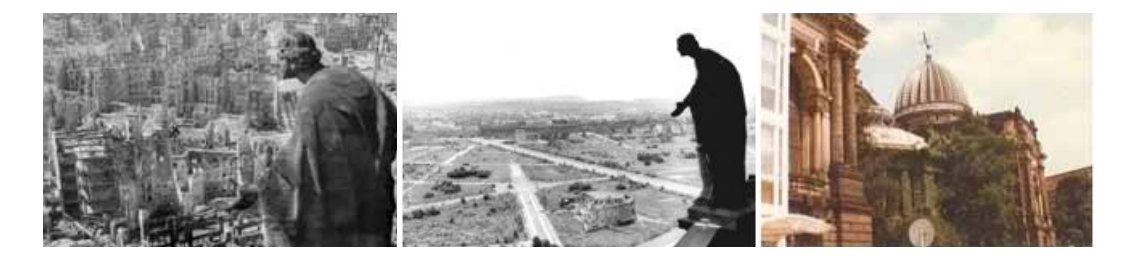
Figure 4. Dresden: the view of the center after the destruction in World War II in 1945 (left), removal of ruins, 1953 (center), the building of the Academy of fine arts in overgrown weeds, recorded 1991 (right).