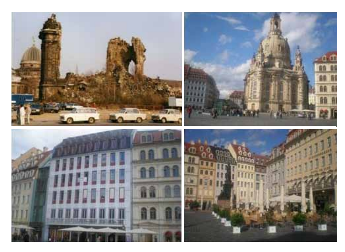
Figure 6. Dresden: Church of our Lady, post war situation (top left) and reconstructed church and square, 2009 (right and bottom).

the restored church along with necessary remodeling and fitting in. As a result, the difference in color is visible on the façades, which is also a unique testimony to history. Then followed an intense planning process to encompass the site of the Church and the overall appearance of the square. This was the first phase in the reconstruction of the square, that started the same year and consistently implemented block by block, building by building in the surrounding of the square, using interpolation of modern architecture where it was possible, but respecting the horizontal and vertical regulations, the subdivision of parcels and façade rhythm.