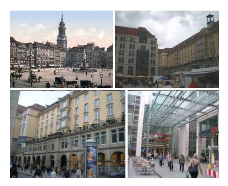
Figure 7. Dresden: Altmarkt square, the former appearance, before II WW, (top left, source: https:// lehmstedt.de) and its present form with facade of the Trade Center Gallery, 2009 (right and bottom).

m<sup>2</sup> on 2.5 hectares of surface. Altmarkt square now has a final form, resembles the former one, as much as it is possible, by its architectural style, regulation, and land use.