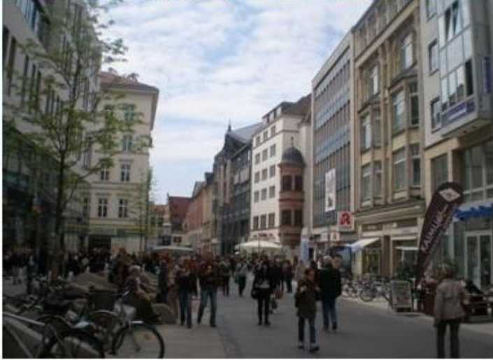
Figure 1. Leipzig: city in the process of renewal, pedestrian zone, 2010. The following analysis of two examples, both in the historical center of the city,