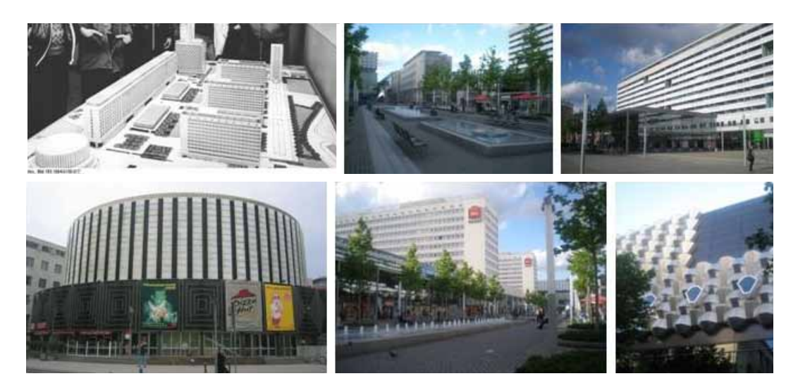
Figure 8. Dresden: Prager Street, model of the awarded design 1962 (top, left), Rundkino (below, left), appearance of the Prague street, 2009 (center and right).