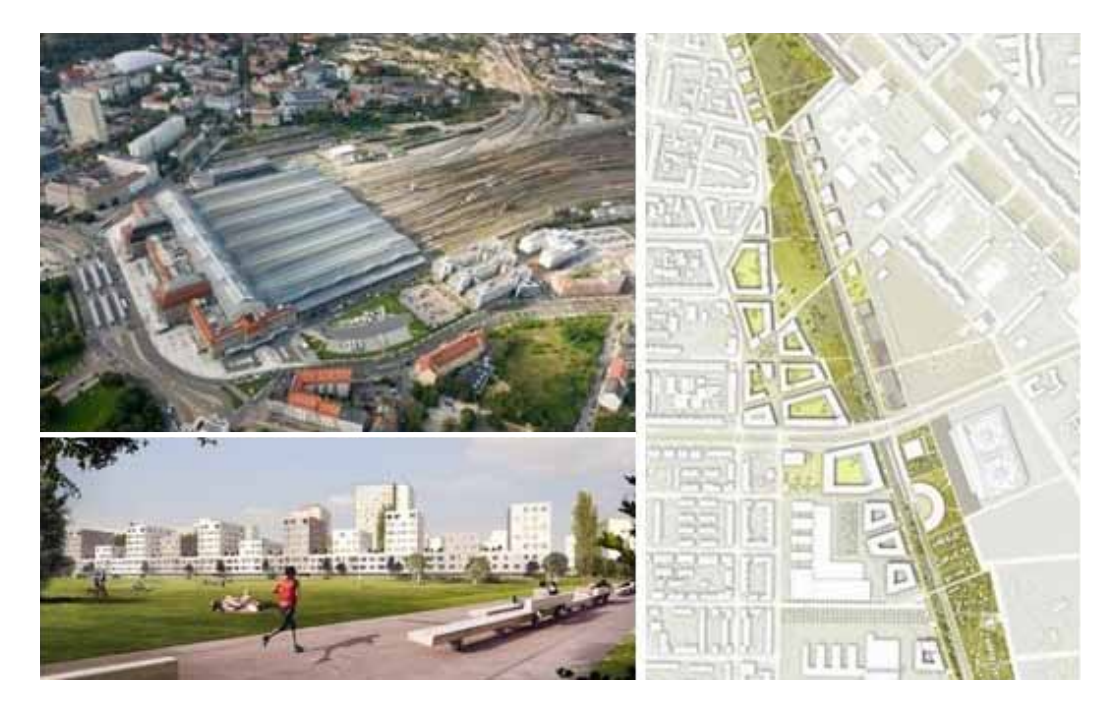
Figure 3. Railway Station Leipzig Hauptbahnhof (top left), the first prize for recycling urban land of the railway station (right, bottom left).

Another example is the railway station, which is dating from 1915, with 24 tracks, functioning as a center for the intercity and international trains, serving as connection with the airport and part of the urban transport system. The station building itself, in addition to its basic functionality, orients towards the needs of all passengers and has a shopping mall on multiple floors. The building, and even more the rail tracks, occupy a huge space in the center of the city. Back in the late 19th century, professionals observed the need to put railway traffic underground and made plans to build a tunnel, but suspended the works for several times, due to historical events, so realization finally happened in 2013, by constructing of two underground platforms. The tunnel took over a part of the traffic, and through the process of reconstruction, a phase by phase, the plan is to reduce urban land occupied by tracks. This is a major investment in the infrastructure project, but with a higher goal. At the same time, in 2011, the city announced an international competition for urban renewal, reconstruction and landscape design of 40 hectares of ex rail land.6 Urban recycling resulted in a new open public space, park, which lacked in central city zone and a supplement to the urban matrix with the new residential buildings (Fig. 3).