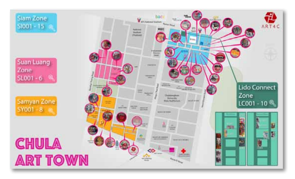
Figure 1. Chula Art Town's 4 zone map.

In google lingo there are five "Stories" or sections with the first titled Chula Art Town, A Public Art Space for the Community followed by 4 "zones" or neighborhood art clusters going by local names: Siam, Lido Connect, Suang Luang and Samyan.