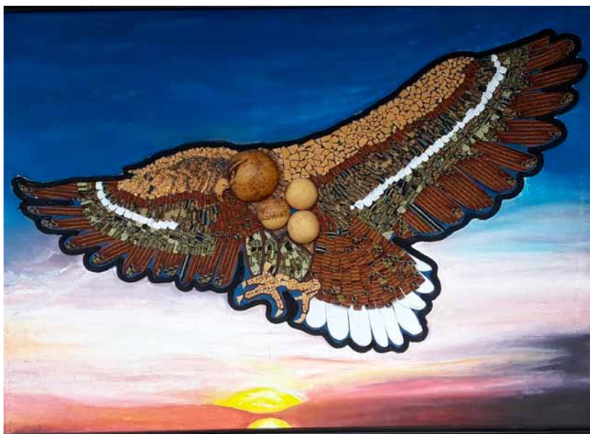
Figure 10. The Eagle in African Woman, calabash, African fabric pieces, fabric paint, stiff fabric, 56 × 81 inches.

The beauty concept of the African womanhood is represented in the seven-character traits of the eagle in the artwork (Figure 10). According to Hentri (2020), the eagle's seven-character traits are discussed below to the philosophical concepts behind the Eagle project; vision, courage, tenacious, high flyers, never eat dead meat, vitality and nurture their younger ones.