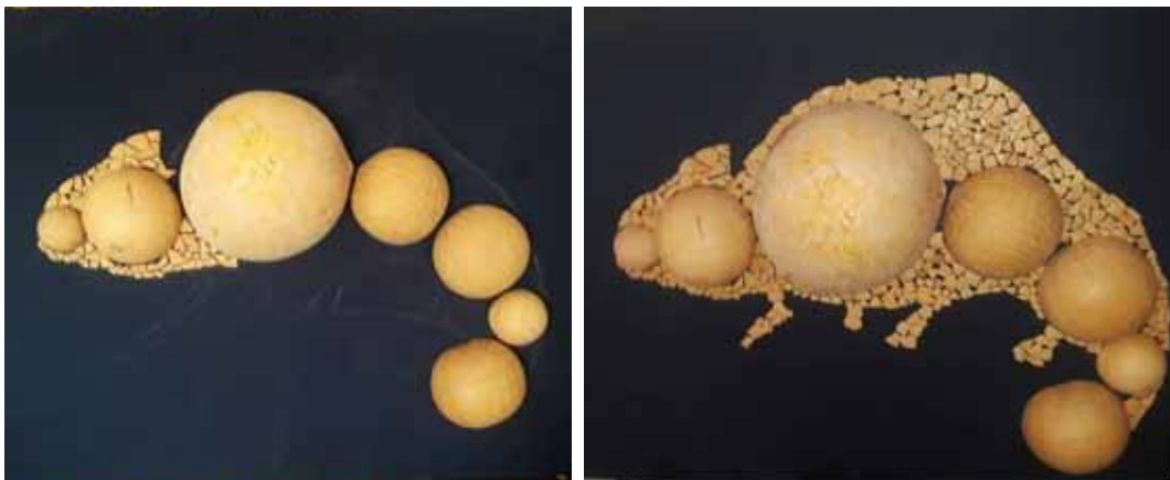
Figure 3. Mounting of materials on the canvas, Studio Practice, 2020, Photo credit: Authors.

The outline of the chameleon was drawn on a paper after which it was transferred unto the canvas followed by an arrangement of the calabashes in various sizes and shapes to conform to the shape drawn on the canvas (Figure 3).