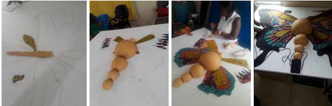
Figure 2. Creation Process of the butterfly art work on a canvas, Studio Practice, 2020, Photo credit: Authors.

At the studio, the structure of the butterfly was drawn carefully on the canvas. This gave a clear outline of the butterfly of which pieces of African prints, nylon cords and calabash was arranged and glued on the canvas to build the artwork (Figure 2).