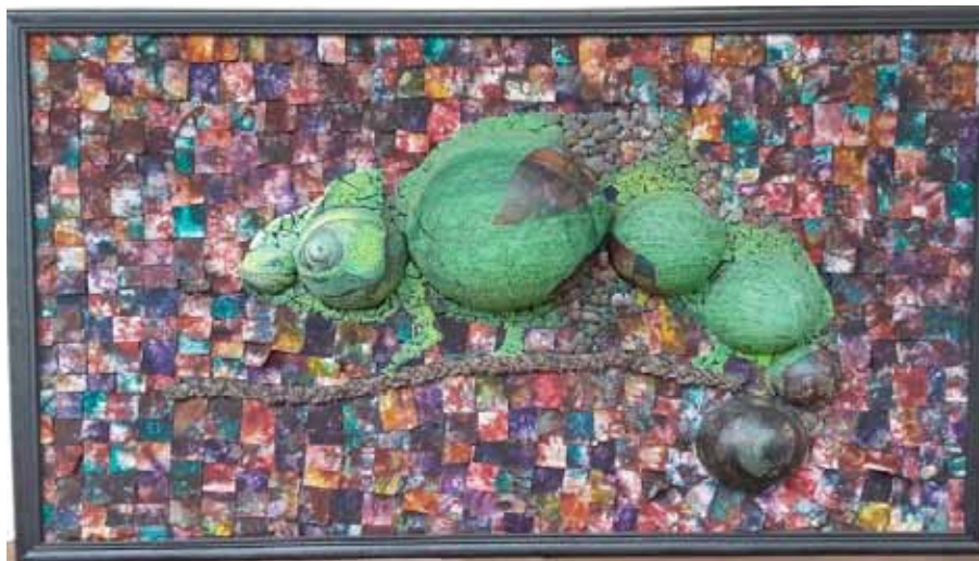
Figure 8. Chameleon woman - The Adaptable Beauty, calabash, dyed fabric pieces, fabric paint, 36×58 inches.

The beauty concept of the African womanhood is represented in the ability of the chameleon to adapt to different environmental changes. Similarly, the African woman can adapt to various changes she might find herself in be it, marriage, childbirth, unfavorable relationships etc. This artwork (Figure 8), therefore, seeks to project the ability of the African woman to still adjust to unfavorable circumstances and come out strong. This makes her beautiful regardless the struggles she goes through.