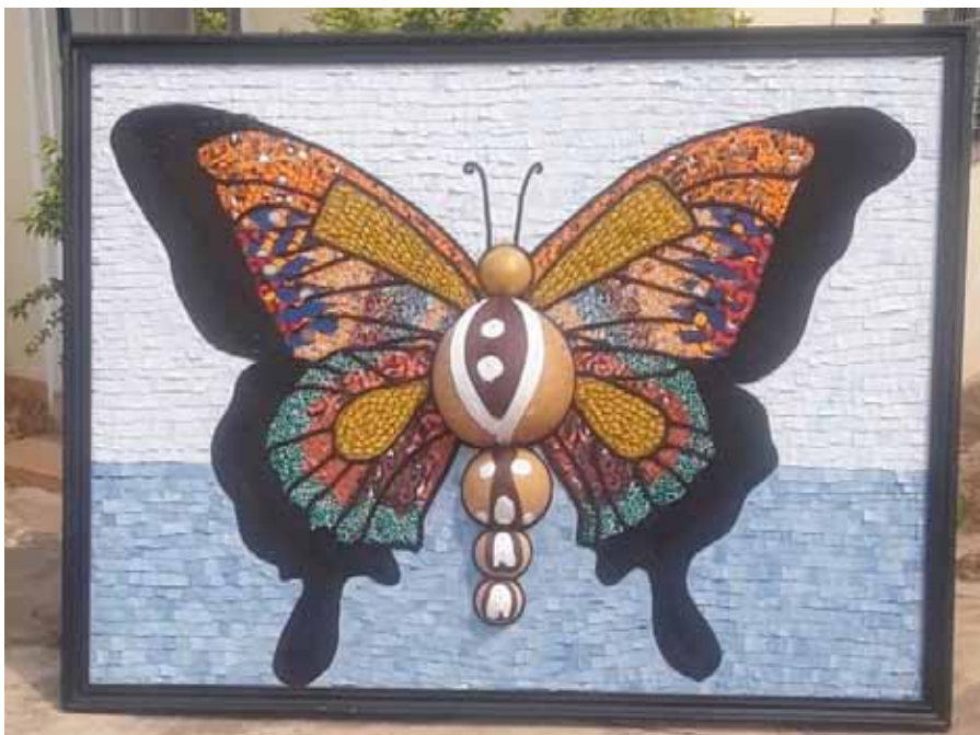
Figure 7. Art Work Afafranto Fefeefe (Beautiful Butterfly), calabash, African prints, nylon cords, fabric pieces, fabric paint, 55× 69 inches.

The beauty concept of the African woman is represented in the various stages of the development of the butterfly. To this effect, these various stages of the development of the butterfly from the artistic concept and philosophical underpinnings, is to project the beauty and struggles of the African woman (Figure 7).