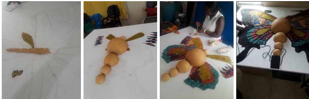
Figure 2. Creation Process of the butterfly art work on a canvas, Studio Practice, 2020, Photo credit: Authors.

At the studio, the structure of the butterfly was drawn carefully on the canvas. This gave a clear outline of the butterfly of which pieces of African prints, nylon cords and calabash was arranged and glued on the canvas to build the artwork (Figure 2).