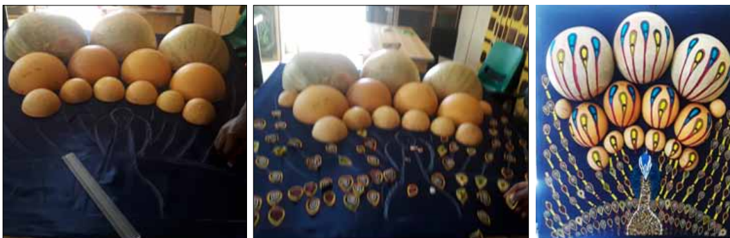
Figure 5. Transferring the design onto the surface, Studio Practice, 2020, Photo credit: Authors.

As part of every design and production process, this work started with the idea development. That is, the outline of the peacock was drawn on paper and transferred onto the canvas stretched on a wooden frame. The calabashes were arranged on the canvas in various shapes and sizes, to conform to the outline of the peacock and eagle. Fabric pieces were cut into and arranged on the canvas to depict the structure of the peacock and eagle. Subsequently, the fabric was painted to give the peacock an actual feather effect (Figure 5), and clouds with emerging sun on the canvas of the eagle artwork (Figure 6).