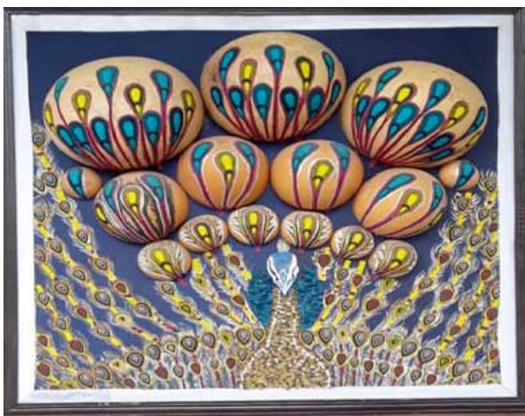
Figure 9. Peacock Woman-Masculinity in Femininity, calabash, African fabric pieces, fabric paint, 51 × 58 inches.

The peacock was selected as the third beauty concept for the artwork (Figure 9). This beauty concept of the African womanhood is represented in the colorful nature and overall beauty of the peacock.