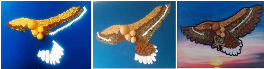
Figure 6. Arranging calabashes and fabric on the canvas, Studio Practice, 2020, Photo credit: Authors.