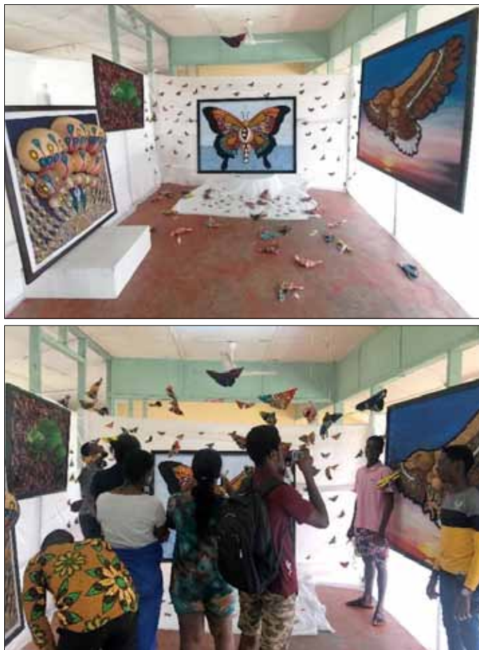
Figure 11. Observers viewing the installation, Photo credit: Authors.

Due to covid-19, the researcher could not mount the work at its designated place (Ministry of Gender, Women and Children Protection, Kumasi). Pre-installation of the work was therefore done in the fashion studio of the Department of Industrial Art at Kwame Nkrumah University of Science and Technology for observers to appreciate the artworks (Figure 11).