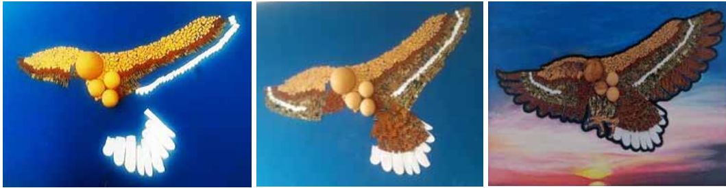
Figure 6. Arranging calabashes and fabric on the canvas, Studio Practice, 2020, Photo credit: Authors.