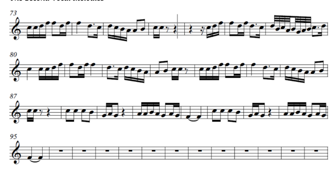
Figure 3. Sukhmani Sahib: the song of happiness.