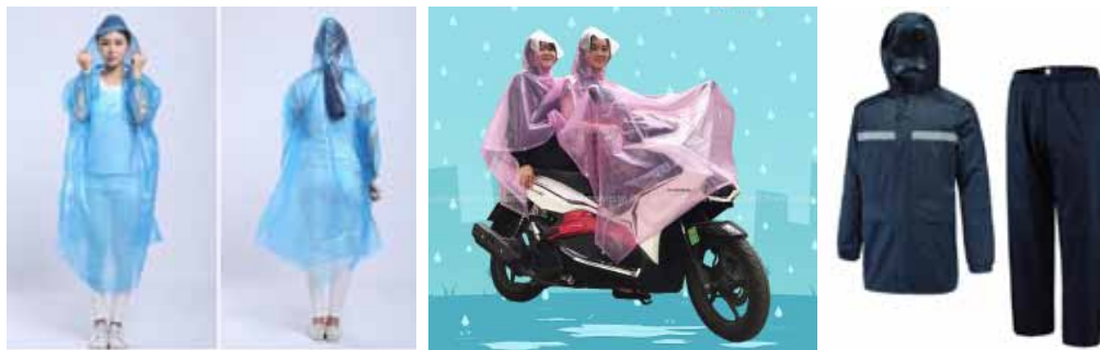
Figure 1. Left, thin, full-body, cheap raincoat (Binh Tien Raincoat Company, 2021). Center, Two-flap raincoat (Viet Raincoat Company, 2021). Right, a rainwear set (rain suit -including pants and jacket (TopList Joint Stock Company, 2020)

"How much do you usually buy a raincoat?," 46.7% of people answered the price "from 5,000 VND to 15,000 VND," 20% of people answered the price "from 15,000 to 30,000 VND," 33.3% of people answered the price is "more than 30,000 VND." The most chosen answer in the 2 questions above is "cheap and convenient raincoat" and the price "from 5,000 VND to 15,000 VND" is referring to the characteristics of cheap full-body PE raincoats mentioned above. In addition to the 2 main types of raincoats above, there are also full-set raincoats, more expensive over-raincoats and specialized raincoats for specific occupations such as raincoats for military and police.