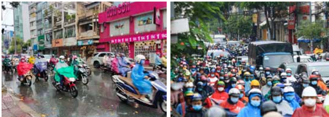
Figure 2. Left, People wearing raincoats move on the central HCMC (Cao An Bien, Doc Lap, 2021). Right, People wearing raincoats in traffic jams in the central HCMC (Le Ngoc Thao, 2021).

When asked "If it rains while moving on the street in central HCMC, where do you usually wear a raincoat?" 76.7% of people chose to pull over to the side of the road to put on a raincoat (in which 50% of people answered "park the vehicle in an empty place on the side of the road to put on a raincoat," 26.7% of people answered "park the vehicle at any place on the side of the road to put on a raincoat"), the remaining 23.3% of people answered "find a sheltered place to wear a raincoat." When it rains heavily, the typical scene often seen on the streets in central