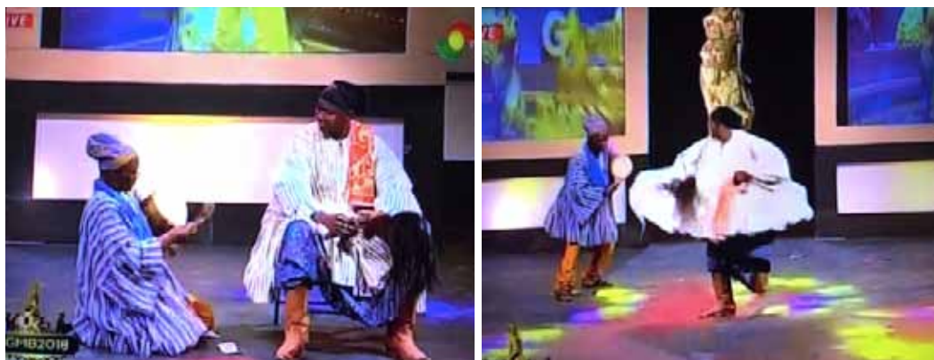
Figure 7. Left, Drum appellation. Right Clothing expressing status. Sour (Field study, 2018).

Fashion has been engaged in expressing the status of personalities.