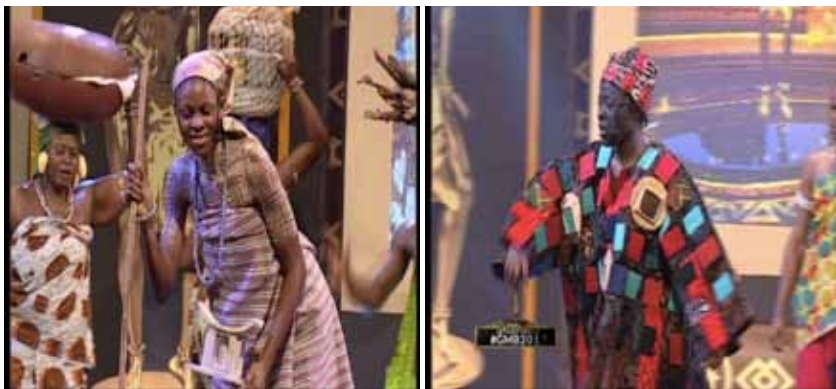
Figure 8. Left, contestant changes into an old lady. Right, lady transformed into a male.

The left image shows a young lady transformed into an old lady with a walking stick through the wearing of clothing, application of make-ups and other accessories. In the right image a contestant was transformed into a male through clothing worn. The outfits here were used to define the role of each participant in the scene. Inglessis (2008) opine that clothing represents one's identity and communicates nonverbally. Clothing in some societies is as functional as language. Outfits have the power to represent a person's age, gender, marital status, ethnicity, social status, and role played. Judges were heard repeatedly commenting that contestants' clothing must reflect the roles played and messages intend to carry across.