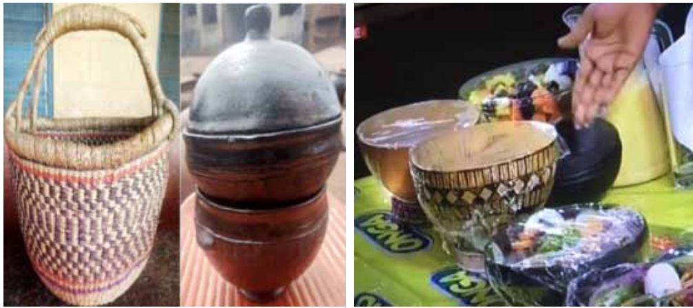
Figure 4. Fashionable presentation of local dishes by GMB Finalists.

When a fashion activity or object is initially introduced, the object must be characterized by conspicuous newness/ novelty and to become "exclusive" when compared to existing objects. (Karunaratne, 2016). Figure 1a has a small basket and bowls set from a local home transformed into a traditional stylish table set (1b) during a cooking competition by GMB contestants. Spectators admitted that the practice was a beauty to behold in the local kitchen. They further acclaimed that fashion comes with a compelling force that brings out the exclusive beauty of every object or events. MacLeod (2013) confirmed this in his statement that fashion in its most general sense is the pursuit of novelty.