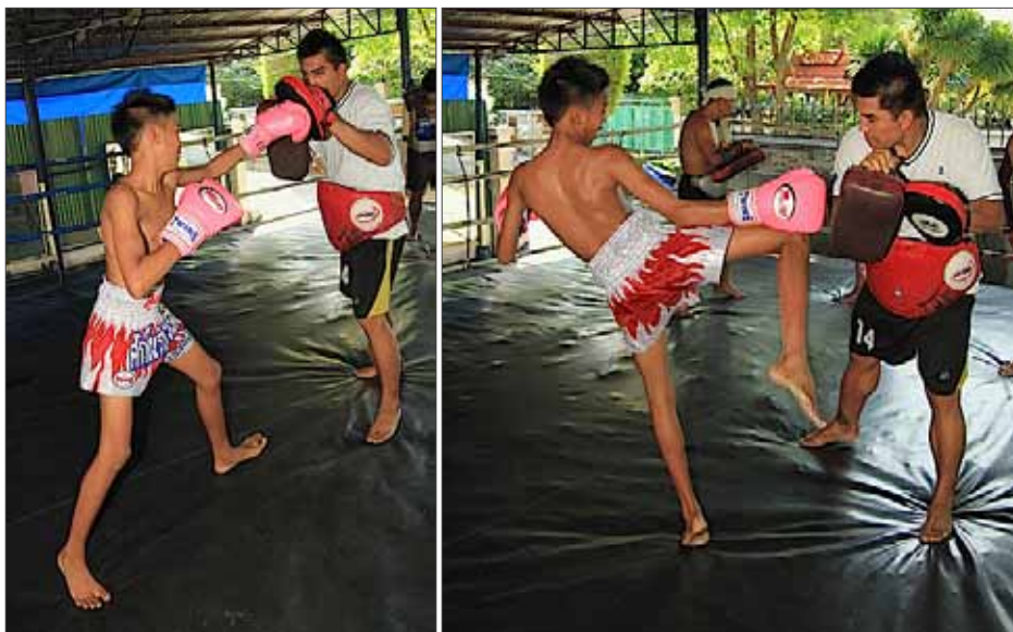
Figure 5. Training at the Joggy Gym Boxing Camp in the Bang Sue District.

a. The continuation of ancient sports: These are those initiated by the long term practitioners of a sport (the attendants of the culture) or those who by interested continue participating in them. In the case of Thai Boxing (Muay Thai is the Thai name for kick boxing), the following sites are active: The Meenayothin Boxing Camp - Chatuchak District, the Joggy Gym Boxing Camp - Bang Sue District, the Aswindum Boxing Stadium - Lat Phrao District, the Kru Suer Boxing camp - Wang Thonglang District, the Maui Chaiya Bahn Chang Thai - Watthana District, the Sor. Vorapin Thai Boxing Gym - (Sor. is short for the first syllable of the founder's name, Surapol) - Taling Chan District, the Sor. Wongthong Thai Boxing Gym - Lak Si District, the Jitti Gym Boxing Gym - Huai Khwang District, and the Phet Yindee Muay Thai Academy - Pathum Wan District. Many gyms have made a name for themselves by producing successful international champions. There is also support for traditional Thai sword art forms at the Phraya Tak Sword Academy - Nong Khaem District, and sword performances and instruction by Mr. Boonterd Buathongkum - Bangkok Noi District. Another popular sport is takraw at the Suan Pa Chaloemphrakiat Sports Park - Khlong San District (Takraw is like a kick version of volleyball played with a rattan ball and net. It is a blend of volleyball and soccer).