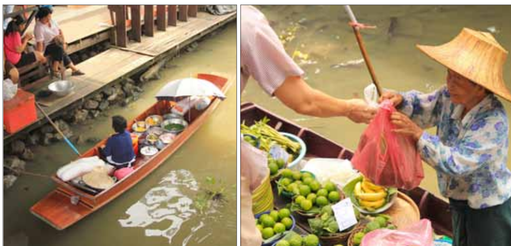
Figure 7. The Taling Chan floating market -Taling Chan District.

c. Markets with expanded community involvement: These are markets with additional commercial or tourism focuses making them a theme destination. For example, a governmental agency helped develop the Taling Chan Floating Market of the Taling Chan District into a tourist attraction. There is also the Leng Buay-Ia Market, which is a center for fresh food and famous restaurants in the Samphanthawong District and the Soi Aree Market that offers ready-made food and is home to several famous restaurants for office workers in the Phaya Thai District.