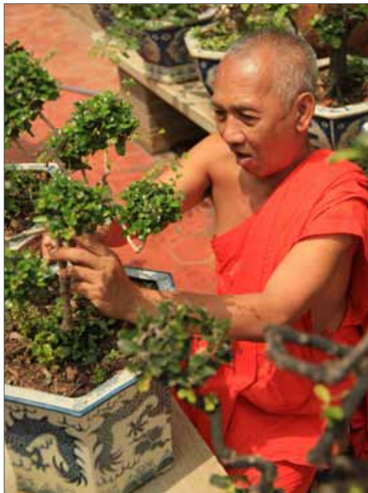
Figure 6. Thai style bonsai at the Wat Khlong Toei Nai temple in the Khlong Toei District.

a. Continuation of ancestral skills: The crafts have been learned from one's ancestors or under the apprenticeship of a master. Craftsmanship is a complicated art, requiring meticulousness, dexterity, and a great deal of experience to become a master craftsman. Some examples from the Phra Nakhon District are the gold smiths that produce gold leaf at Bahn Gold Leaf and the Thai Theatrical Costumes by Bahn Mae Piak. The Buddhist alms bronze bowl makers in the Bangkok Noi District and the Thai style of Bonsai at the Wat Khlong Toei Nai Temple in the Khlong Toei District.