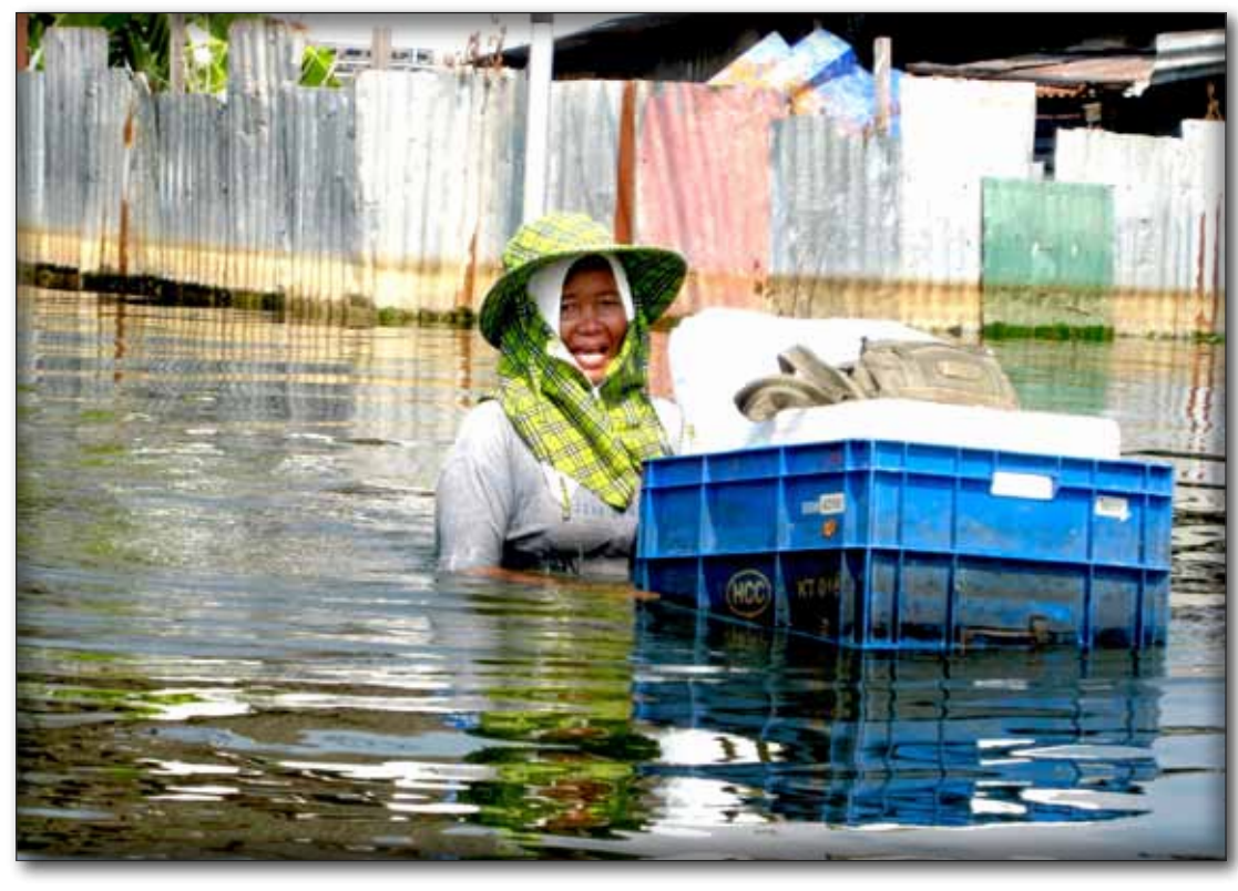
The flooding is widespread and is affecting millions of people. Some wait patiently. Some their patience has run out.