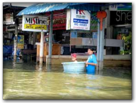
Some kids have fun. Some do not know the dangers.