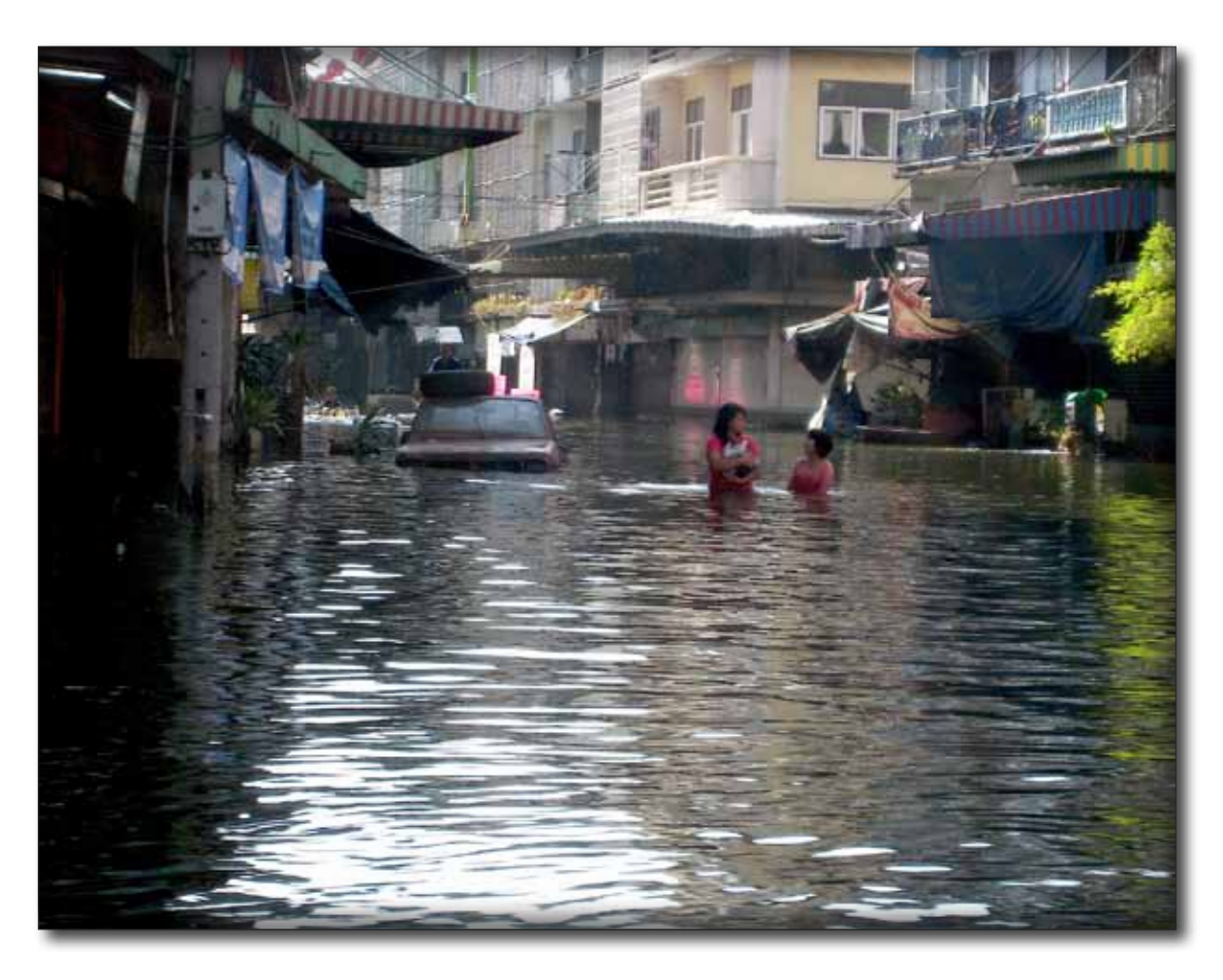
Some signs are now ironic that used to be welcoming.