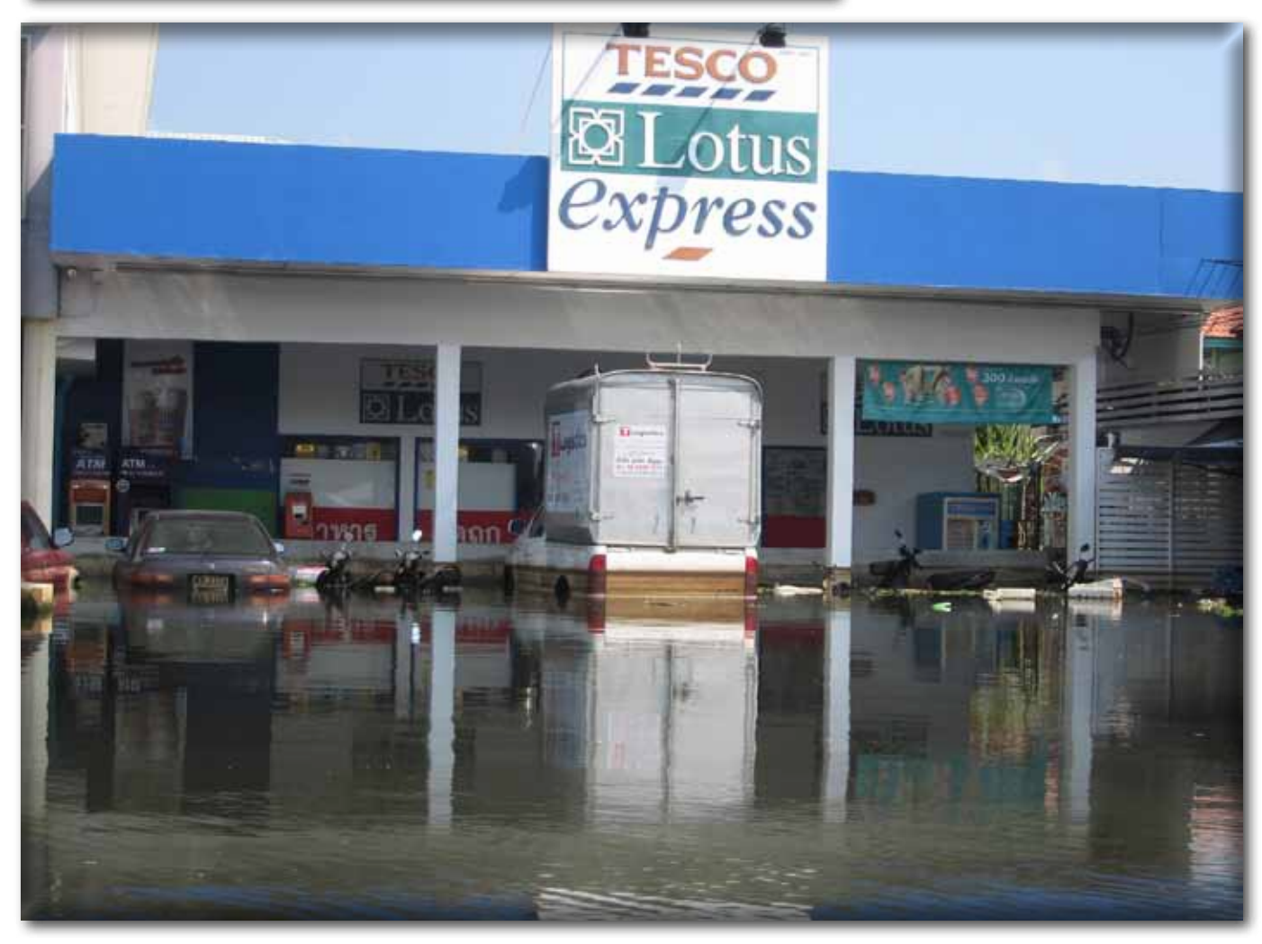
Some went to the quickie mart and quickly ended up running for their lives.