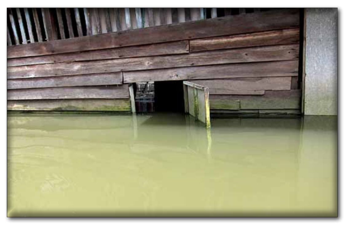
Home became a reflective isolating island for some and others left leaving the door open.