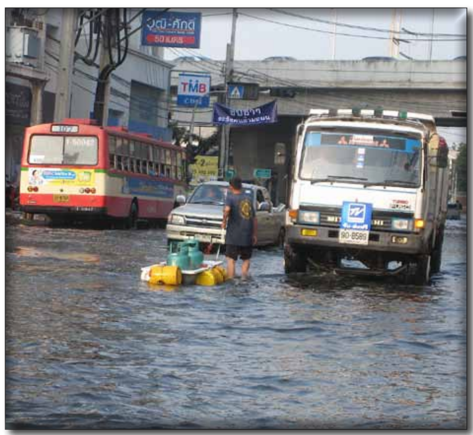
Going to the store became different.