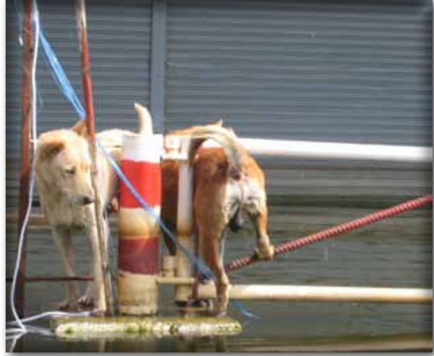
Some remain an island.